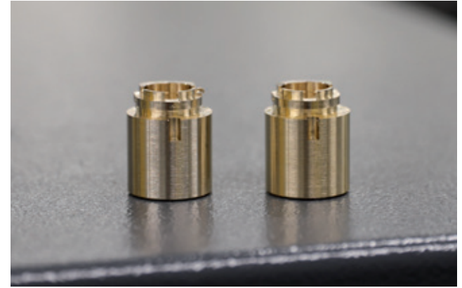
6-sided complete machining: The Hyperturn 65 Powermill is equipped with 5,000 rpm main and counter spindles, a 12,000 rpm BMT turret incl. Y-axis for a maximum of twelve driven tools, and an 18,000 rpm milling spindle with B-axis, enabling the complete machining of various parts made of brass with dry machining in batch sizes down to 1.